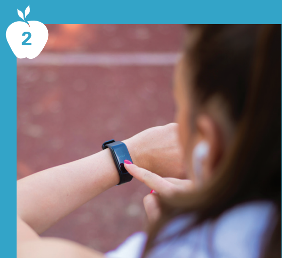
Figure 2 Walking is a cheap and easy way of getting exercise and can be built into your day. A pedometer, sports watch, or an app on your phone that measures steps can act as an additional motivational tool.