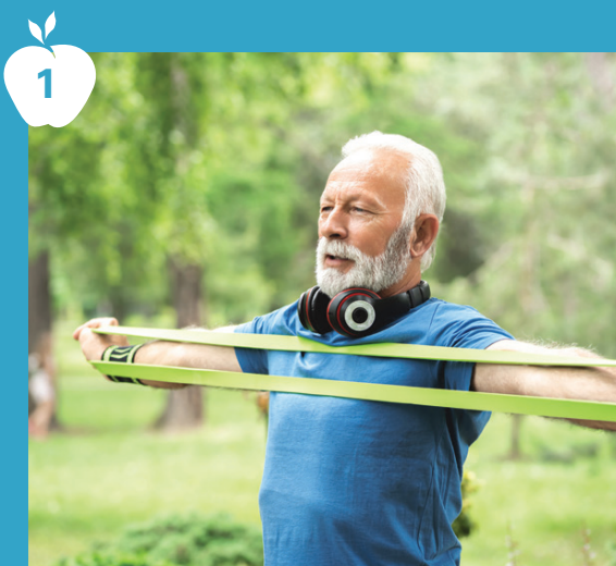
Figure 1 Traditional exercise prescriptions focused on aerobic exercise, but it is now recognised that health benefits, particularly for people with diabetes, are best built upon by doing some strength (resistance) exercises too.

Exercise also reduces the level of fat in the body, particularly round about the tummy area. It is thought that it is this mobilisation of the body's fat stores, by exercising, that might improve blood glucose control. Less glucose in the blood, because it's now stored in the body's muscle, means the blood flows better and some of the blood vessel complications associated with diabetes may be avoided.