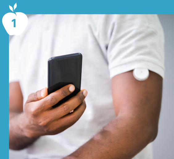
Figure 1 Many people living with diabetes use wearable technology-enabled devices to monitor their glucose levels to help with self-management, with a reduced need for finger pricks.

Symptoms happen more often in those with new or existing type 1 diabetes. People with type 2 diabetes may have no, or very few, symptoms, prior to diagnosis.