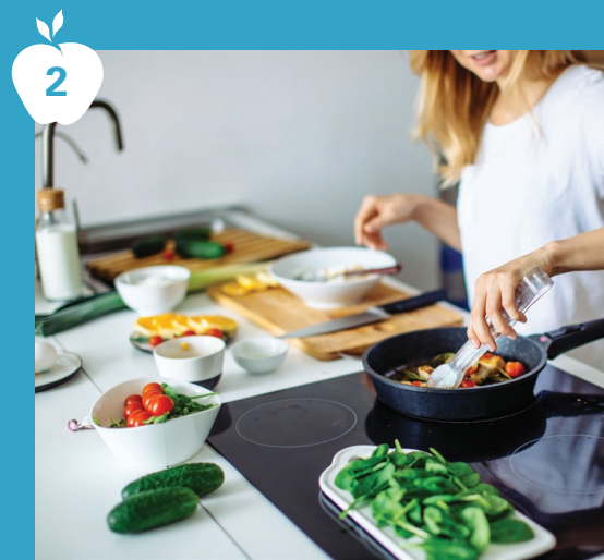
Figure 2 Healthy eating and physical activity are the cornerstones of good diabetes management.