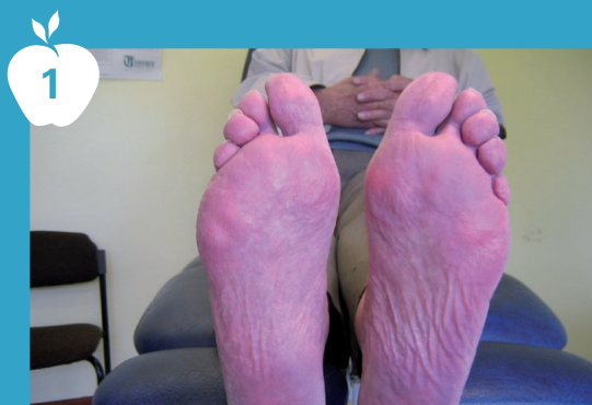
Figure 1 The progress of the neuropathy is dependent on blood glucose control but factors such as duration of diabetes, age, smoking, high blood pressure and high cholesterol also play a part.

Neuropathy can affect nerves throughout the body but due to the long length of the nerves to the foot, damage happens there first.