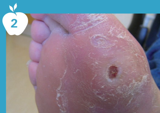
Figure 2 Overtly dry skin can lead to deep cracks in the skin and could lead to a foot ulcer.