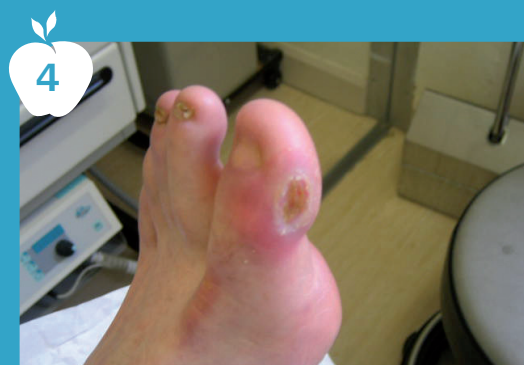
Figure 4 If you have a wound which does not heal, see your podiatrist immediately.