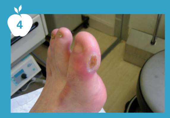
Figure 4 If you have a wound which does not heal, see your podiatrist immediately.